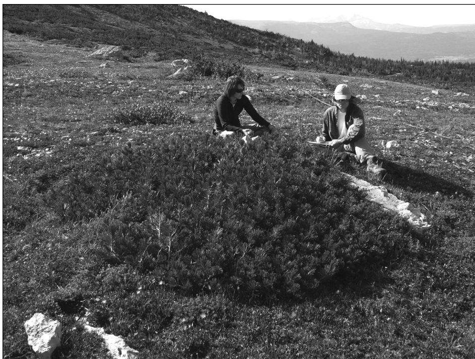
Fig. 1. A whitebark pine grows in a sheltered microsite in the immediate lee of a boulder at alpine treeline near Divide Mountain, Blackfeet Indian Reservation, Montana.

establish rapidly after a burn and often grow at the highest elevations of any associated conifers (Tomback, 1986; Tomback, Anderies, et al., 2001; Mellmann-Brown, 2005). Consequently, whitebark pine facilitates community development, mitigating harsh conditions and favoring the growth of shade-tolerant competitors (e.g., Callaway, 1998). In the upper subalpine forests and treeline ecotone, whitebark pine stabilizes soil by reducing erosion; spreading pine canopies shade large areas and regulate the rate of snow melt downstream flows (Farnes, 1990; Tomback, Arno, and Keane, 2001).