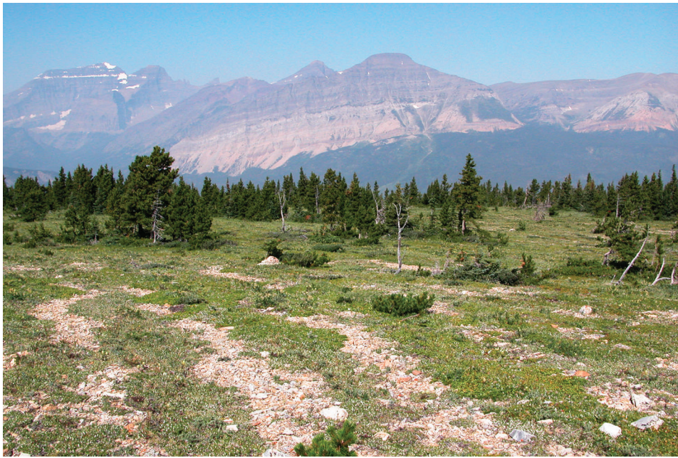
FIGURE 1. Hedges, illustrating positive spatial association, and individual seedlings, illustrating association with microrelief, extend into tundra above the contiguous forest in the treeline ecotone at Lee Ridge, Glacier National Park, Montana, U.S.A.